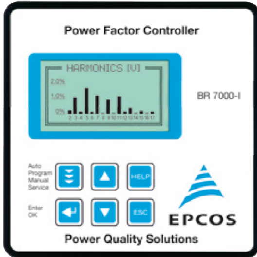
BR7000-I series front view